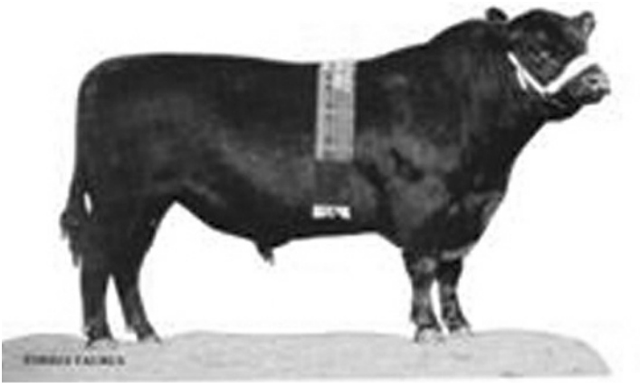
Photo: Taurus T19 - our first Royal Show Grand Champion Melbourne 1977

Our decision to return to showing is because we but of all other breeds. During this time and into the believe that the Angus Cattle we have in our herd 1980's our cattle achieved much success in the show today are unique in both type and genetic makeup ring winning numerous Interbreed Championships, within the Angus breed in Australia. The purchase in twelve Royal Show Grand Championships and three 2006 of the four top Hoff Scotch Cap cows has taken National Angus Heifer Show Champions. our cattle to a new level in the industry. This We are excited about our role in providing the substantial investment has resulted in progeny with industry with genetics that have those strengths in more growth, muscle and yield than mainstream traits that we believe the breed is in dire need of to Angus but more importantly are of total outcross take it forward into the future. With our existing herd genetics bred from a herd that has dominated the backed by 45 years breeding being complemented by Angus Industry in the USA for decades. the infusion of these new Hoff genetics, also with 45 years of breeding, we are able to offer the industry Angus cattle bred from herds on opposite sides of the world by cattlemen with identical breeding philosophies with a combined 90 years experience. We look forward to sharing these genetics with the Australian industry.