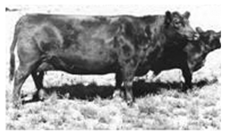
Photo: Quail J2 - our first registered female in 1965 and dam of our first Royal Show Grand Champion, Taurus T19.