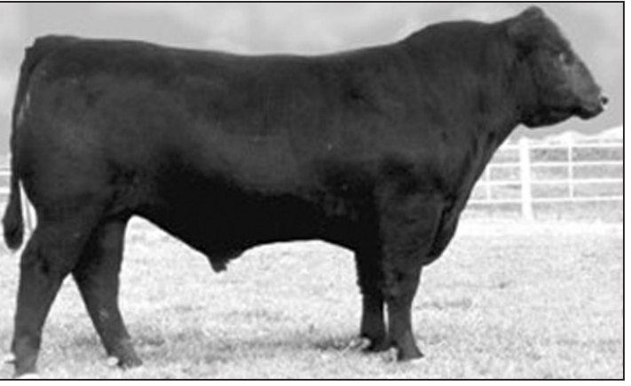
Connealv Danny Boy - His first sons sold to $21,000 - exclusive to Raff Anaus. his Blackbird and Moriah progeny are outstanding.

FOLLOWING THE OUTSTANDING SUCCESS OF OUR USA EMBRYO PROGRAM WE HAVE IDENTIFIED A NUMBER OF YOUNG BULLS THAT WE ARE USING AS STUD SIRES IN OUR