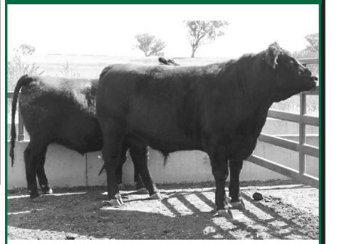
The single most important factor influencing profit is weight. That's why growth has such a high priority in our breeding program!